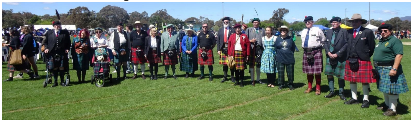
Clan representatives at the Canberra Gathering