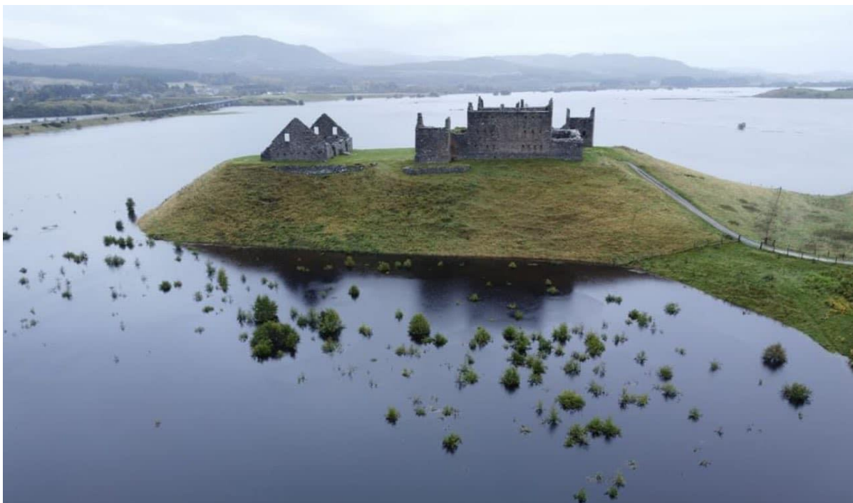
The River Spey in flood, surrounds Ruthven Barracks in October. Kingussie is in the background (top left)

For more information go to www.savingwildcats.org.uk/wild and Critically endangered wildcats now call the Cairngorms National Park home | RZSS