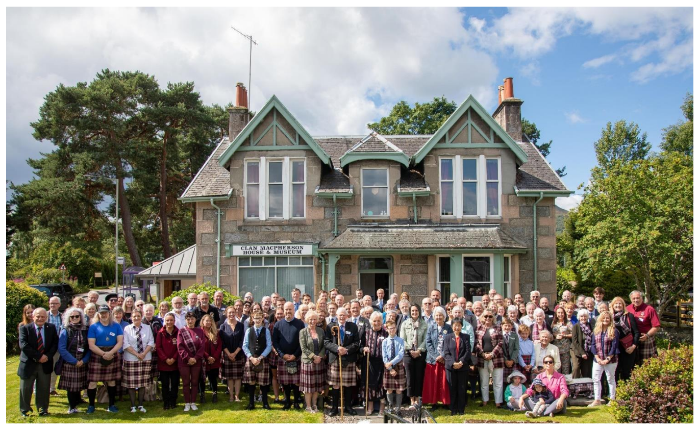
Clansmen, Clanswomen and Friends gathered at Clan Macpherson House, Newtonmore to celebrate the 75<sup>th</sup> and 70<sup>th</sup> Anniversaries of the CMA and the Clan Macpherson Museum respectively.