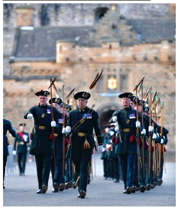
The Royal Company of Archers involved in the ceremonial activity at Edinburgh Castle

Prominent among those involved in the Scottish component of the funeral of Her Late Majesty Queen Elizabeth II was The Royal Company of Archers. Several Macphersons are members of the Company, most of whom were on duty in Edinburgh, and some in London.