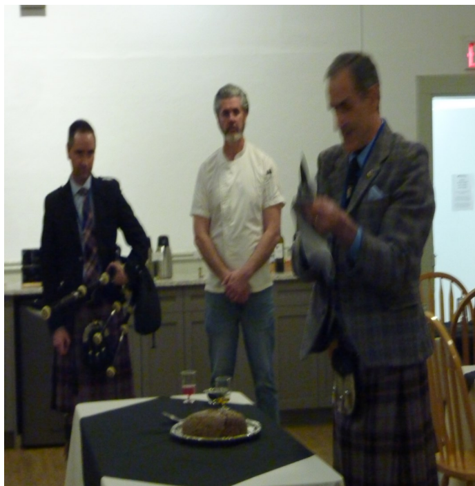
The most important part of any Burns Dinner—The Piper, The Chef and the Toaster! Thank you!